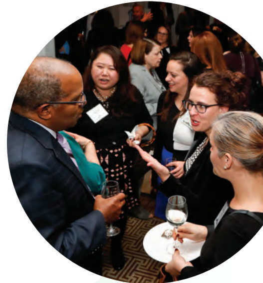
Above: Guests gather for PCPC's annual political outreach event.

Chair of the Board, Personal Care Products Council Former Group President, North America, The Estée Lauder Companies 2017 Annual Meeting Chairman's Remarks