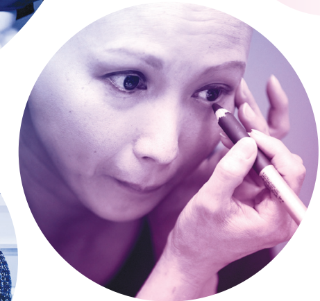
LORD & TAYLOR CHARITY DAY